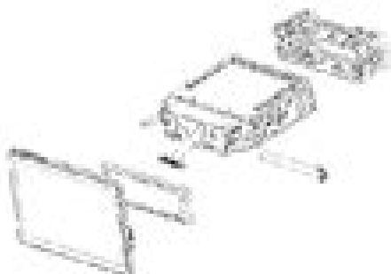
1. SPECIAL FRONT LOAD AND MOUNT YOUR SET TOOL