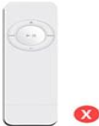
iPod shuffle 1