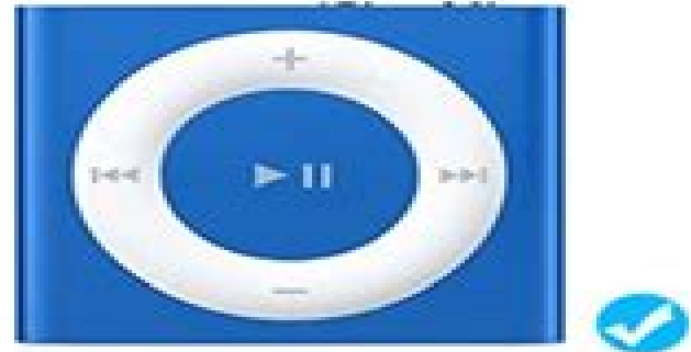
iPod shuffle 4/5/6/7