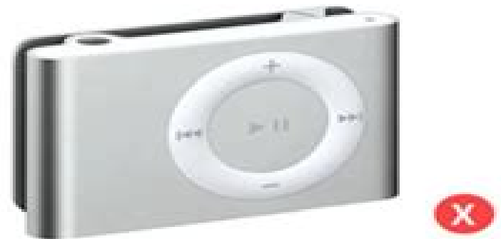
iPod shuffle 2