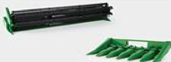
• 224 "fingerline" grain head and 643 low side corn head