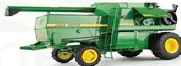
• 360° spreader and 6400 heavy duty rear axle