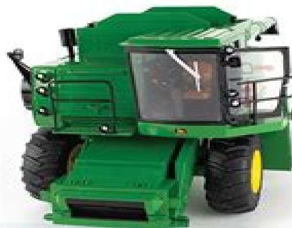
• Left and right side cab doors will open