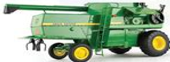
• 360° spreader and 6400 rear axle