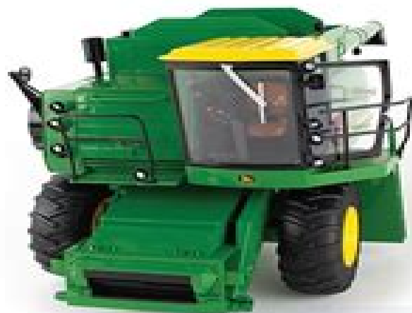
• Feeder housing will raise and lower