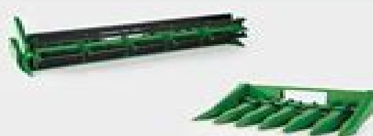
• 224 "paddle" grain head and 643 low side corn head