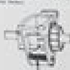
Position 3 Turn in handle left-hand Turn feedgate tight to closed

To drill large size hay, including timothy, alfalfa, clover, and other hay seeds.