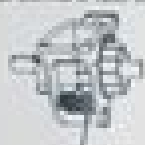
Position 2 Turn in handle left-hand Turn feedgate tight to closed

To drill medium-sized seeds, including alfalfa, clover, timothy, and other hay seeds.