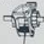
Position 1 Turn in handle left-hand Turn feedgate tight to closed

To drill wheat, barley, corn, soybeans, sunflower, sorghum, millet, and other small seeds.