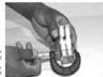
1. Introduction 2. Background 3. Methodology 4. Results 5. Conclusion 6. References