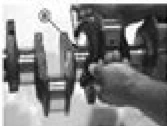
Copyright © 2004 John Wiley & Sons, Ltd.