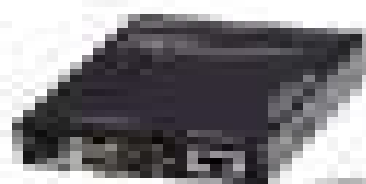
High-speed data transfer and secure communication.