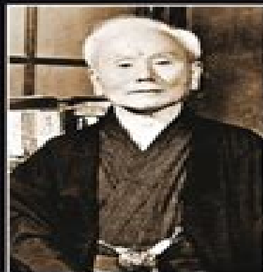
Gichin Funakoshi KARATEDO