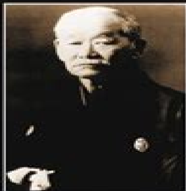
Jigorô Kanô JUDO

L'histoire des trois fondateurs des arts martiaux