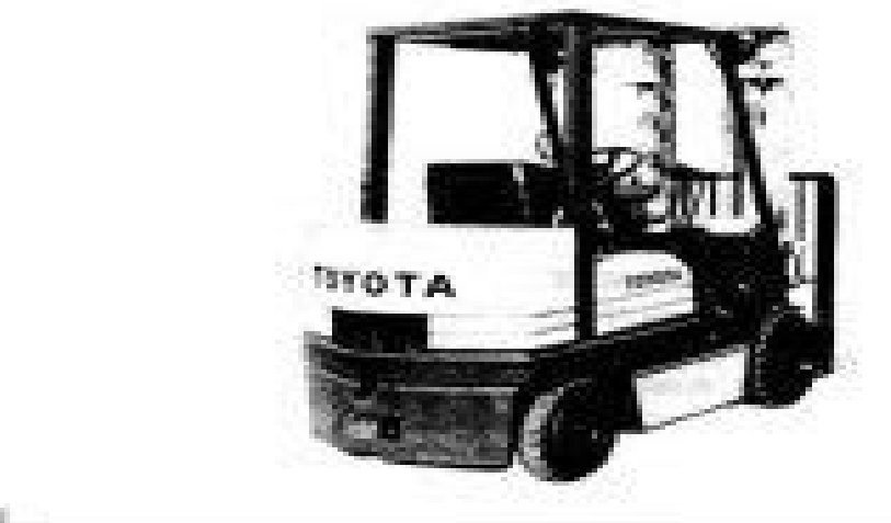
Vehicle Rear View