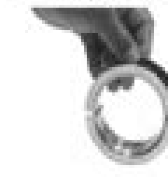
Assembled Main Thrust Bearing