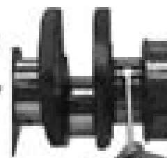
Measuring Main Thrust Journal Width