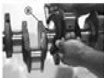
Measuring Crankshaft Main Bearing Journal OD