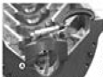
Measuring Main Bearing Cap ID Assembly

Radial or rotational crankshaft fit does not fall within above specifications.