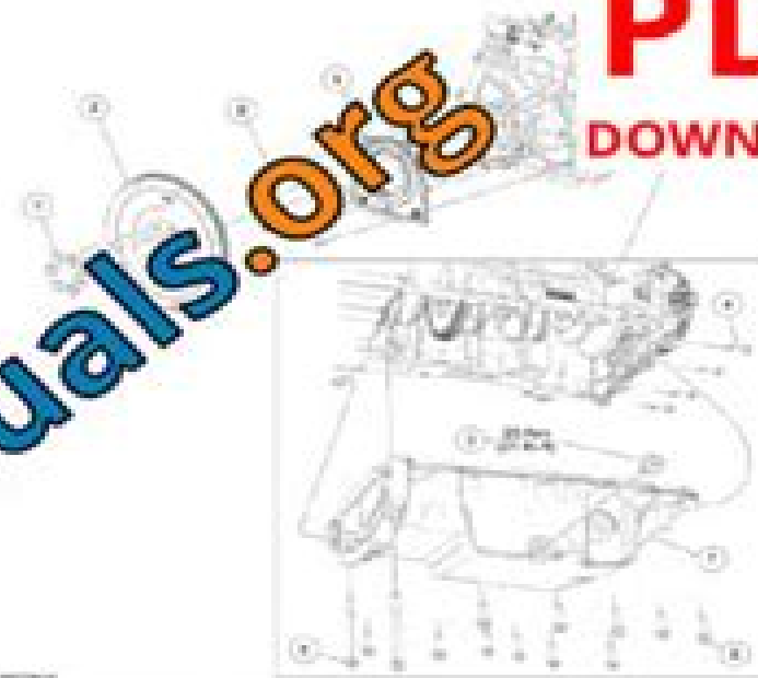
Fig. 46: Exploded View Of Drivebelt, Flexplate & Crankshaft Rear Seal With Torque Specifications - Lower End Components Courtesy of FORD MOTOR CO.