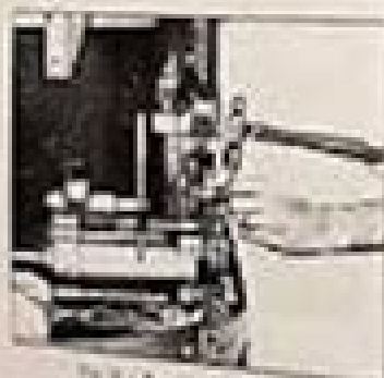
Fig. 12 - Assembly of Valve