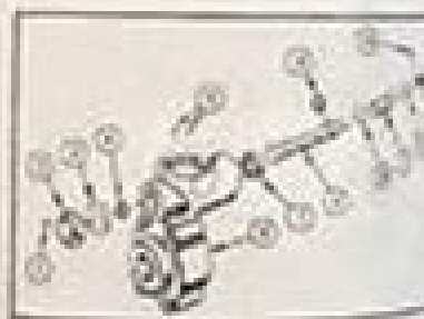
Fig. 14 - Exploded View of Fuel Valve