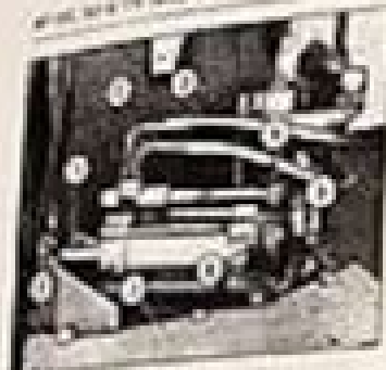
Fig. 11 - Assembly of Valve

4000 Series (4000 40 40) and 4000 Series Models