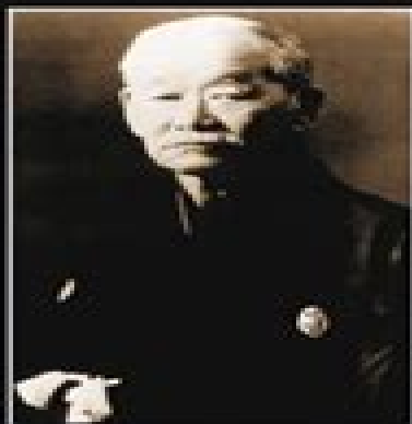
Jigorô Kanô JUDO

L'histoire des trois fondateurs des arts martiaux