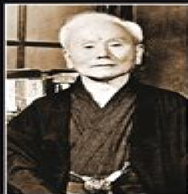
Gichin Funakoshi KARATEDO