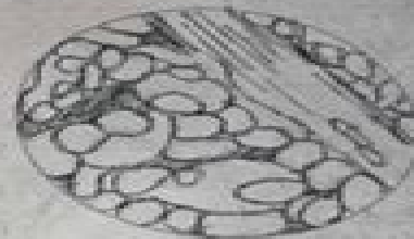
Specimen: unipolar neuron Total Magnification: _____