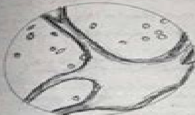
Specimen: multipolar neuron Total Magnification: _____