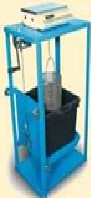
Sp. Gr. & Water Absorption Test