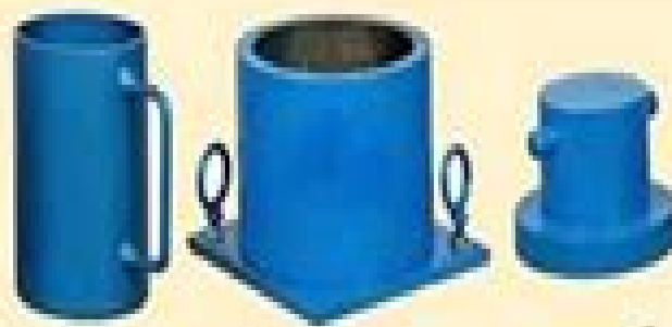
Crushing Value Test