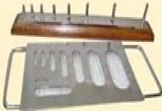
Flakiness & Elongation Test