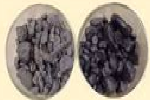
Bitumen Adhesion test