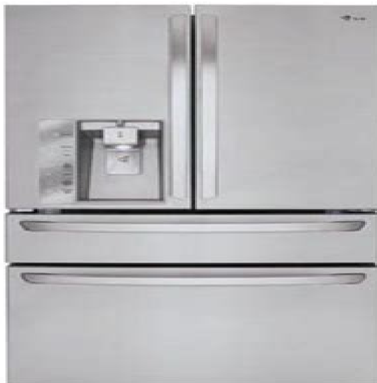
MODEL : LMXS30756S