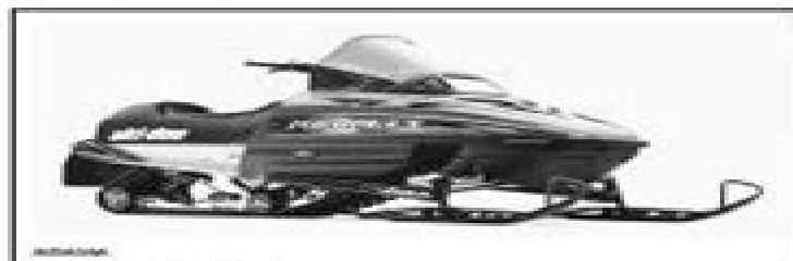
TYPICAL — S-SERIES