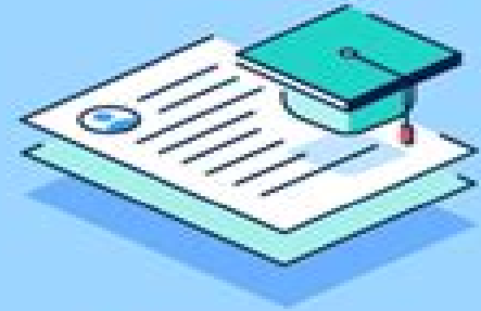
Student loan applications