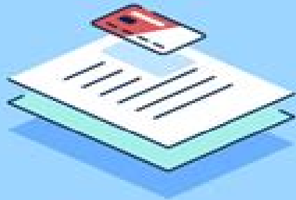
Credit card applications