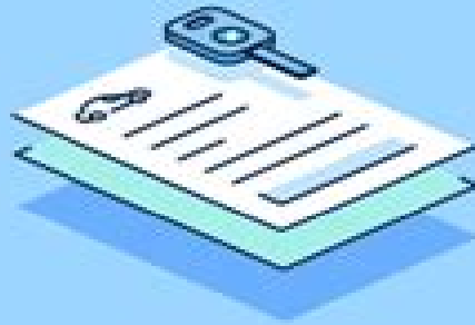
Auto loan applications