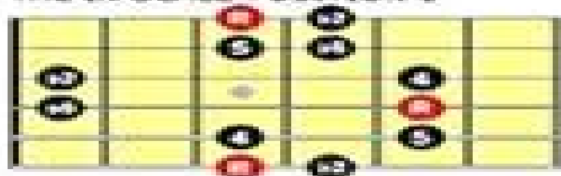
THE IN SCALE-POSITION 1