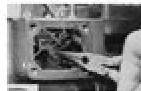
(7) Injection Pump Cover (8) Rocker Arm (9) Rocker Arm