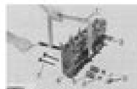
(1) Valve Spring Retainer (2) Valve Spring (3) Valve (4) Valve Spring Retainer (5) Valve Spring Retainer (6) Valve Spring Retainer (7) Valve