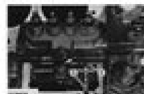
(5) Camshaft Pin (6) Pin