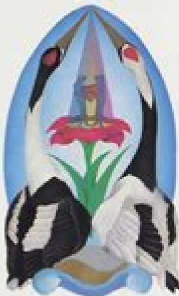
22 L'Âme sœur