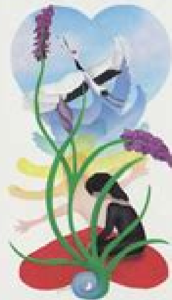
13 La Transformation