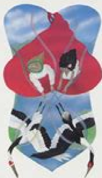
7 Le Chariot