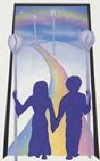
Quatre des Bâtons