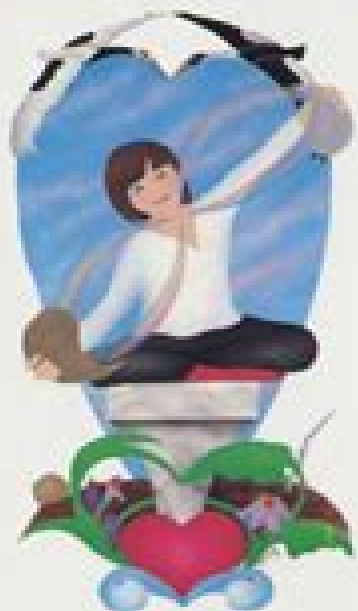
1 Le Bateleur