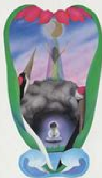
9 Les Chercheurs