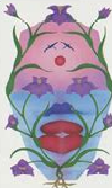
Neuf des Fleurs