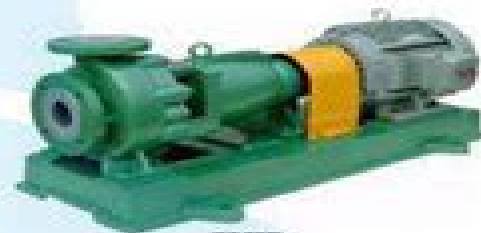
IHF chemical pump