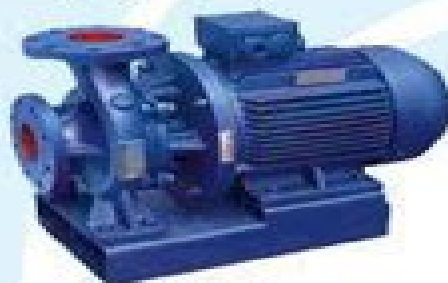
ISW pipeline pump