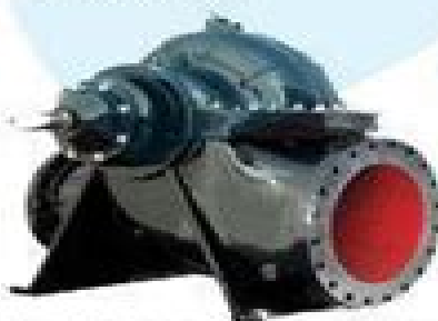
double-suction water pump