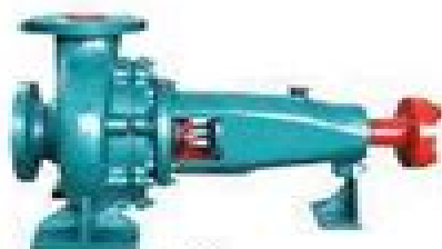
IS water pump