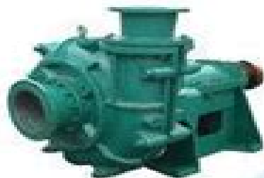
ZGB centrifugal pump