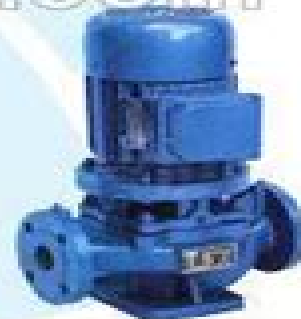
ISG water pump