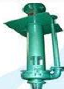
SP submersible slurry pump