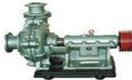
PNJ rubber liner pump