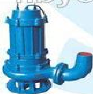
WQ submersible sewage pump