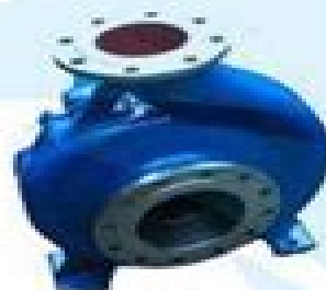
IH chemical pump