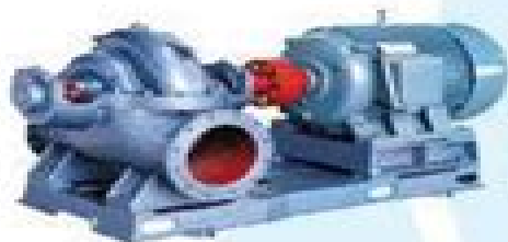
SH type double-suction water pump