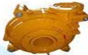
AH centrifugal pump