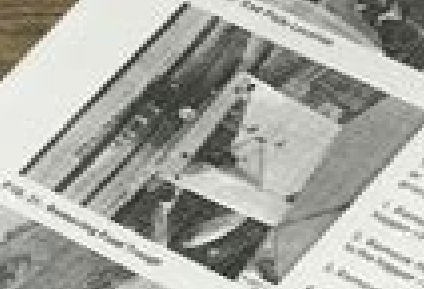
FIG. 21. Removing the feed trough.

The hopper must be cleaned regularly. This is done by removing the hopper cover and cleaning the hopper with a brush. The hopper must be cleaned after every use. The hopper must be cleaned after every use. The hopper must be cleaned after every use. The hopper must be cleaned after every use.