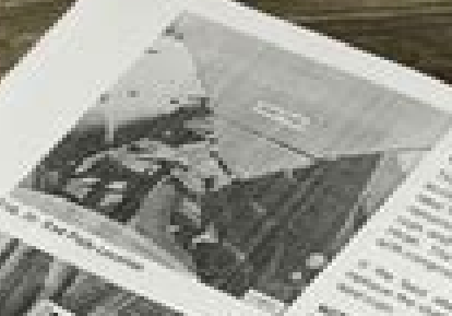
FIG. 20. Cleaning the hopper.