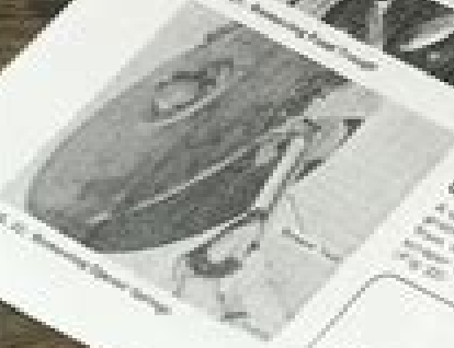
FIG. 22. Using the scraper tool.

To remove the feed trough, first disconnect the feed trough from the machine. Then, use a wrench to remove the feed trough. The feed trough must be removed after every use. The feed trough must be removed after every use. The feed trough must be removed after every use.