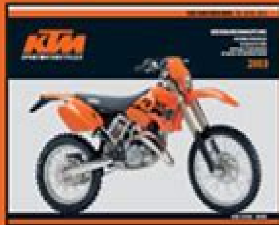
Engine Service Manual