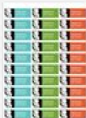
Photo address labels