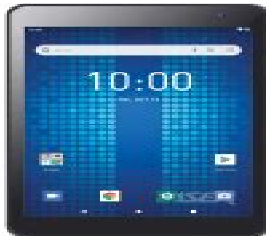
MID-789 / MID-789HPS / MID-1089PS