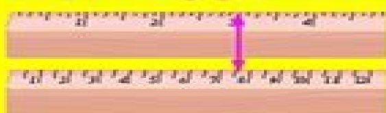
Example 1: Changing 3 inches to centimeters