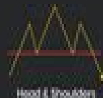
Head & Shoulders