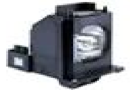
9150400001 - Lamp With Mounting $25.00 - Philips / MITSUBISHI ★★★★★ = 4