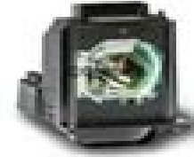
TV Lamp 915000001 with Mounting for Mitsubishi TV $25.75 - Philips / MITSUBISHI ★★★★★ = 4