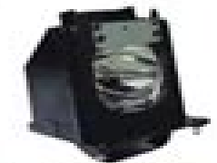
TV Lamp 915000001 for 917500000, 91751700, WD-67114, WD-67023, WD-65733, WD-65724, WD-65603, WD-73723