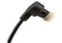
TV 50000 4000F Ear Taps for TV Earbuds - 8 pack More Details: Item $25.00 ★★★★★ = 4