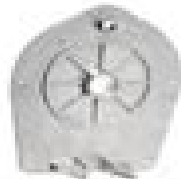
Wireguard WP-3023 Antenna Base Plate 10 $15.95 - 40% off Only 1 left in stock - order soon ★★★★★ = 3