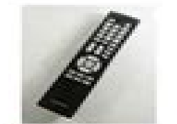
Whisper Remote Control Part Number 200700000 $24.95 Only 1 left in stock - order soon ★★★★★ = 3