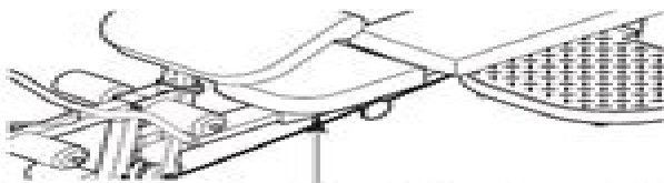
Serial Number Decal (under seat)

Write the serial number in the space above for future reference.