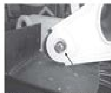
Fig. 4-30 Tilt pin with capscrew and washer securing AD-Tack™ grease pin to tiltarm.