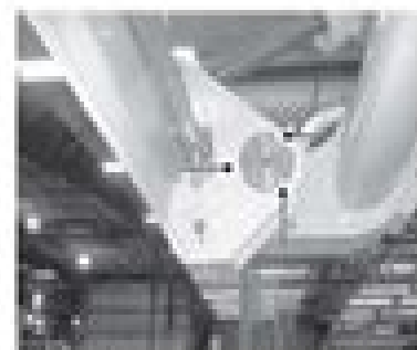
Fig. 4-29 Tilt pin with capscrews securing the grease cap to the tiltarm.