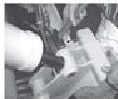
Fig. 4-28 Close lower tilt cylinder joint of AD-Tack.