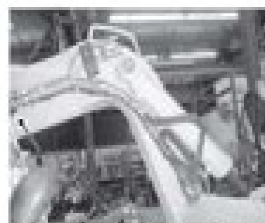
Fig. 4-31 Location of electrical connector on left tiltarm lower joint. Flip the correct plastic ties to free the power harness to the tiltarm, too.

Installation Procedure: Reverse the removal steps.