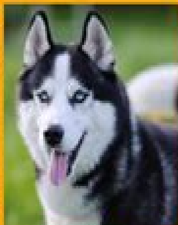
HUSKY DE SIBÉRIE