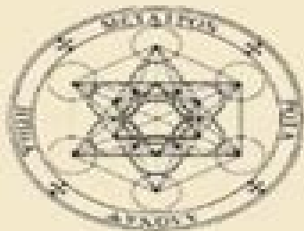
Pentacle de Metatron