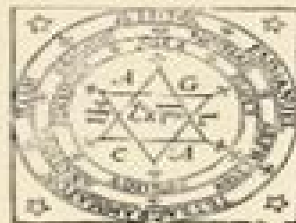
Pentacle de Salomon