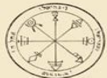
Pentacle de Vénus