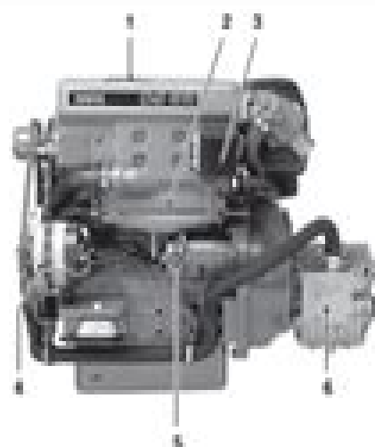
Co-10 A/B with reverse M20L