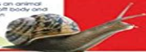
snail A snail is an animal with a soft body and a shell on its back.

A B C D E F G H I J K L M N O P Q R S T U V W X Y Z