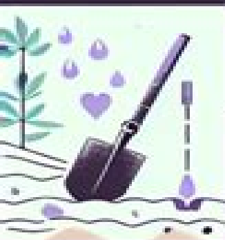
SHOW IT YOURSELF