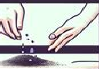
PREPARE THE SOIL