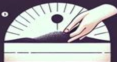
PLANTING THE SEEDS