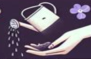
WATERING THE SEEDS