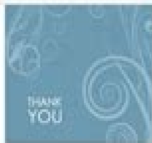
Thank you cards