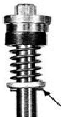
Carbon seal assembly—Model TN-27.

D. Part #303261 drive pin and #303327 washer not required for installation of seal assembly on Model TN-28, UNLESS collar #303031 on driveshaft breaks when pressing to proper position. If collar breaks, remove same from driveshaft and install #303261 drive pin and #303327 washer—see instructions—paragraph "C" and "D" for Model TN-27.