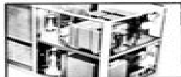
Interior view showing conservatively rated power equipment, heavy-duty modulator.

OPERATING CONTROLS — The operating controls are located on top of the pedestal within easy reach. These controls include: grid tuning and bandswitch; main plate tuning with slide rule indicator dial; auxiliary plate tuning switch and coarse and fine coupling controls. Plate current is indicated on a permanently connected plate meter, and a combination grid current/modulator current meter furnishes readings as desired with the flip of a switch. Less frequently used controls including the tamper-proof, key operated main switch are located on the lower panel. Plate overload reset and transmission "mode" switch, as well as fuses, indicator lights and the permanently connected plate voltmeter are also located on the lower panel.