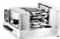
Completely shielded, plug-in power amplifier.