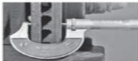
Measuring brake rotor wear. 00.04 Maintenance