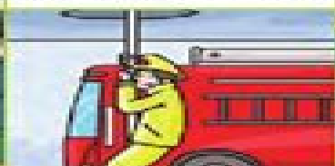
la caserne de pompiers