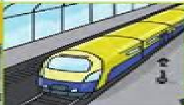
la gare de train