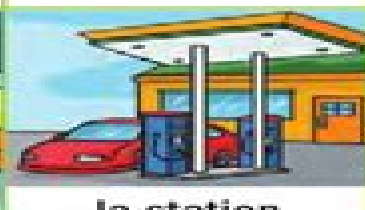
la station d'essence