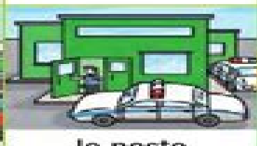
le poste de police