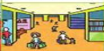
le centre commercial