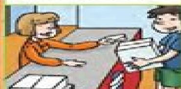
le bureau de poste