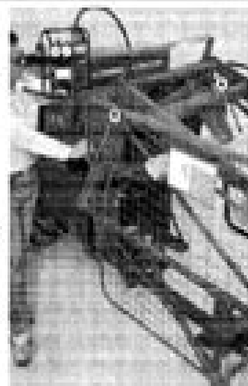
Illustration included as cover