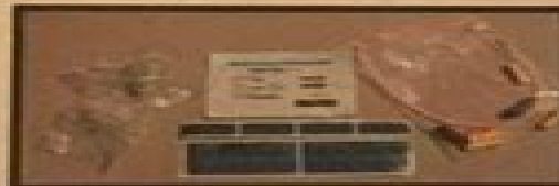
ACCESSORY KIT Spare Mouthpieces, Tamper Seals to be placed at all connections, Posi-Lock and Posi-Tap Connectors with instructions, Zip Ties

THIS MANUAL, ITS CONTENTS, AND ALL WIRING INFORMATION MUST BE KEPT CONFIDENTIAL AND OUT OF THE CUSTOMER'S POSSESSION.