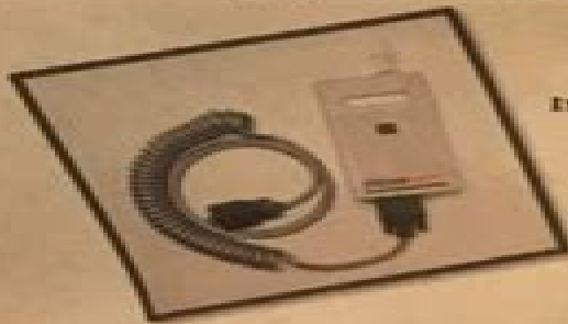
INTOXALOCK HAND HELD Pre-programmed for state requirements

Each Legacy Installation Kit will contain the following: