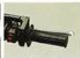
Twist this grip and your goodbyes to competition.

The 1987 KXT250 Tecate. Strictly for riders who are serious about having fun.