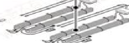
Cord with connector (E30-4953-05)