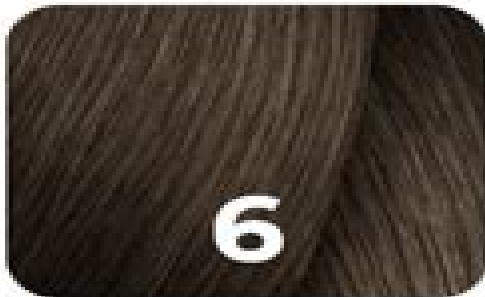
6 Dark Blonde