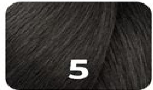
5 Light Brown