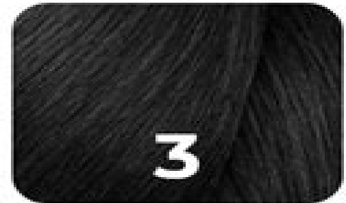
3 Dark Brown