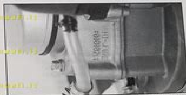
2) Il numero di serie del motore è stampigliato sulla parte posteriore del carter sinistro