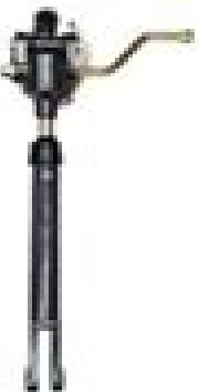
1884342R Levelling Box Assembly