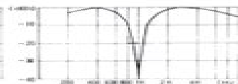
Notch Filter Characteristics