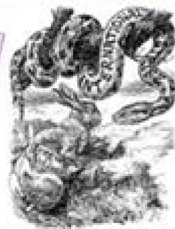
The magnet says: 'My offensive equipment being practically nil, it remains for me to disarm the foe with the power of my eye.'