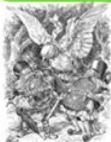
MAGNETS FOR MURDERERS.