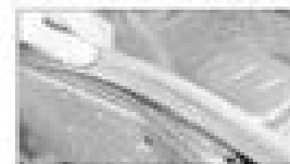
2-23: Radiator and fan assembly

2-6: Radiator and fan assembly 2-7: Radiator and fan assembly 2-8: Radiator and fan assembly 2-9: Radiator and fan assembly 2-10: Radiator and fan assembly 2-11: Radiator and fan assembly 2-12: Radiator and fan assembly 2-13: Radiator and fan assembly 2-14: Radiator and fan assembly 2-15: Radiator and fan assembly 2-16: Radiator and fan assembly 2-17: Radiator and fan assembly 2-18: Radiator and fan assembly 2-19: Radiator and fan assembly 2-20: Radiator and fan assembly 2-21: Radiator and fan assembly 2-22: Radiator and fan assembly