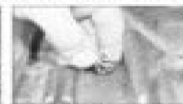
2-24: Radiator and fan assembly