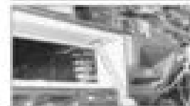
2-6: Radiator and fan assembly