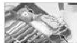
2-26: Radiator and fan assembly